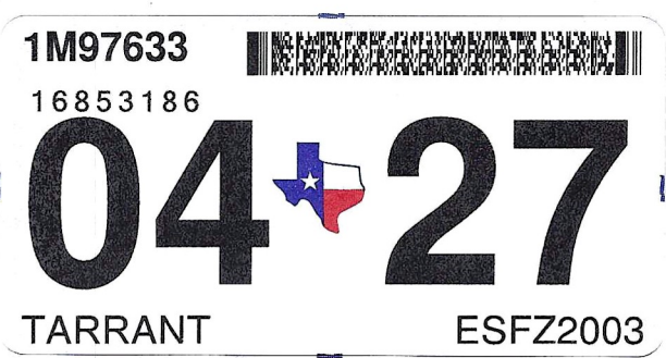
WINDSHIELD STICKER / CALCOMANÍA DE PARABRISAS

PEEL FROM BACK ONLY / DESPEGUE POR DETRÁS