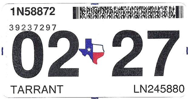
WINDSHIELD STICKER / CALCOMANÍA DE PARABRISAS

PEEL FROM BACK ONLY / DESPEGUE POR DETRÁS