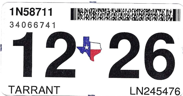
WINDSHIELD STICKER / CALCOMANÍA DE PARABRISAS

PEEL FROM BACK ONLY / DESPEGUE POR DETRÁS