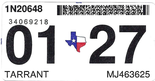
WINDSHIELD STICKER / CALCOMANÍA DE PARABRISAS

Peel sticker from any corner. Despegue la calcomanía de cualquier esquina.