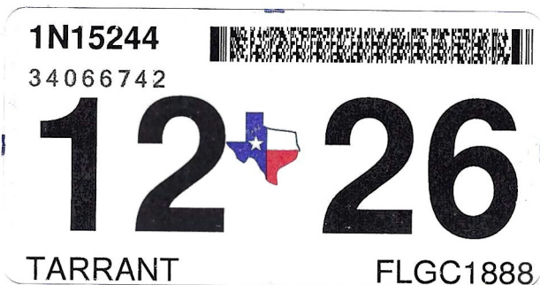
WINDSHIELD STICKER / CALCOMANÍA DE PARABRISAS

PEEL FROM BACK ONLY / DESPEGUE POR DETRÁS