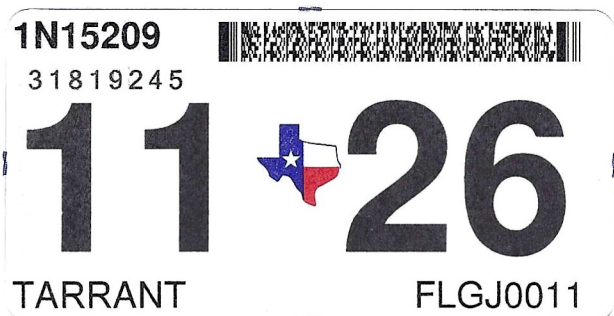
WINDSHIELD STICKER / CALCOMANÍA DE PARABRISAS

PEEL FROM BACK ONLY / DESPEGUE POR DETRÁS