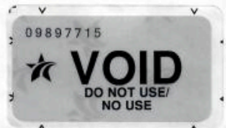
PLATE STICKER / CALCOMANÍA DE PLACA