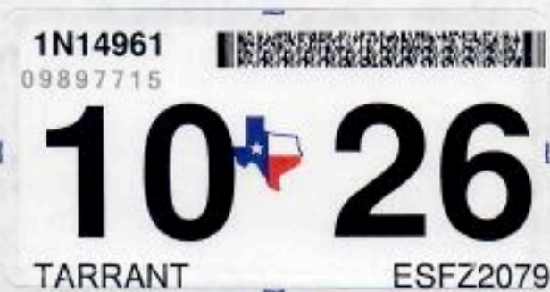
WINDSHIELD STICKER / CALCOMANÍA DE PARABRISAS

Peel sticker from any corner. Despegue la calcomanía de cualquier esquina.