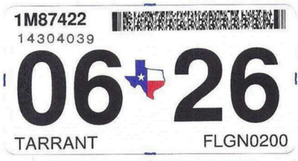
WINDSHIELD STICKER / CALCOMANÍA DE PARABRISAS

PEEL FROM BACK ONLY / DESPEGUE POR DETRÁS