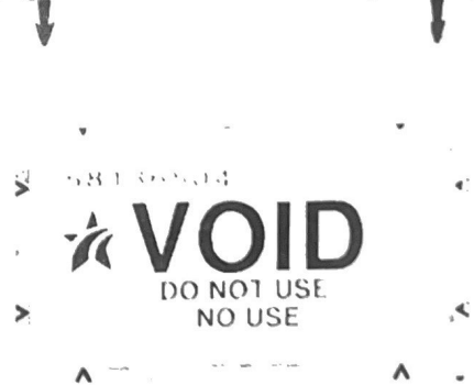
PLATE STICKER / CALCOMANIA DE PLACA

Peel sticker from any corner. Despegue la calcomanía de cualquier esquina.