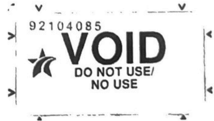
PLATE STICKER CALCOMANIA DE PLACA

Peel sticker from any corner. Despegue la calcomanía de cualquier esquina.