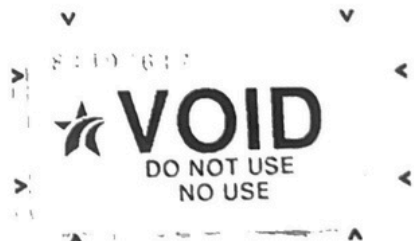
PLATE STICKER / CALCOMANIA DE PLACA

Peel sticker from any corner. Despegue la calcomanía de cualquier esquina.