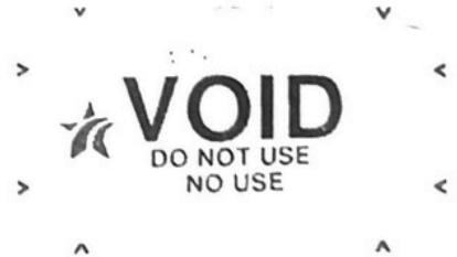
PLATE STICKER / CALCOMANIA DE PLACA

Peel sticker from any corner. Despegue la calcomanía de cualquier esquina.